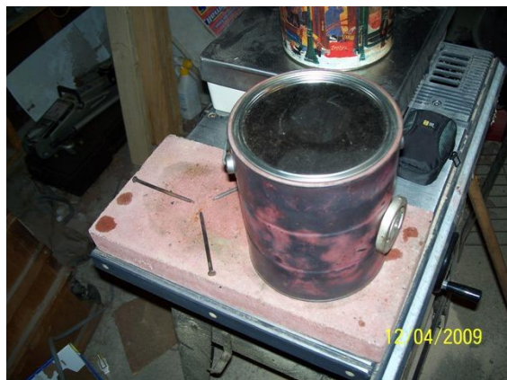
Fig. 9: Quenching char

Although the combustion has stopped, the TLUD still has to cool and that may take several hours. Alternately, the hot char can be transferred to a separate “Quench Can”, with an airtight lid to allow the char to cool in the absence of oxygen. If one transfers hot char, please wear gloves and be careful. Notice how hot the char is at the end of the burn, as shown by the thermometer in Figure 8, which is indicating over 600 Fahrenheit. If the char is placed in a Quench Can, the Toucan fuel container will cool quickly and then may be refueled and relit.