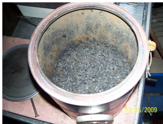
Figure 10: 1G Toucan Biochar

Once cooled, the Toucan can be emptied of biochar. The biochar is much less dense than the original wood pellets. Also, the wood shrinks during pyrolysis and the Toucan will produce about one half the original fuel volume as biochar. Figure 10 shows the finished biochar, which can be used “as is” or crushed. It is added directly to potting soils or gardens, typically at about 10-20% of the root soil volume. Remember to provide additional fertilizer at the same time with the biochar, or it will soak up all the available nutrients in the soil, and then slowly release them back to the plants. Alternately, add the biochar to an active composting process and it will be “good to go” when the composting is completed.