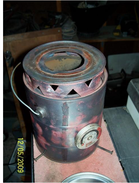
Figure 4: Completed TLUD

The last piece of the 1G Toucan is a chimney. A chimney ensures that sufficient secondary air is introduced through the side openings of the Crown and sweeps the secondary flames up through the center opening. It also improves the combustion by containing the flame in a turbulent vertical column. Figure 5 shows a 4" diameter by 24" tall chimney, using a piece of galvanized duct (from the hardware store). Alternately, a #5 can, 4" in diameter and 7" tall, can be used – this is the typical 46 ounce juice can size.